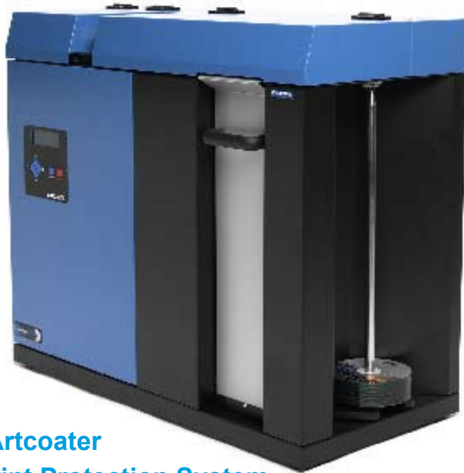
The Copytrax Artcoater CD and DVD Print Protection System